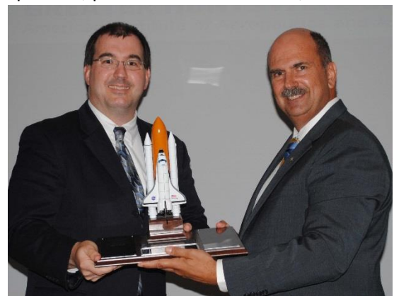
Presentation of Chairperson's Plaque

The Greater Huntsville Section is among AIAA’s oldest and is one of the largest sections with almost 1000 professional members across Alabama and Mississippi.